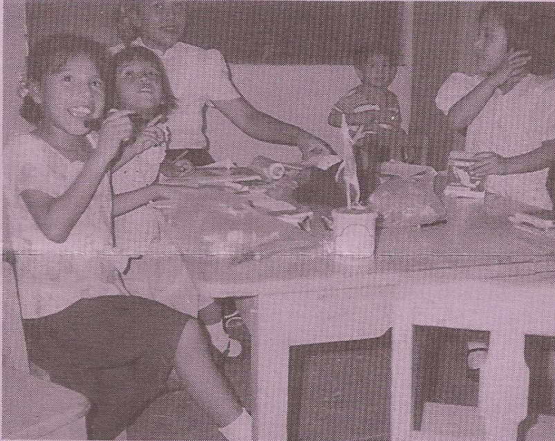
During free time, we can make colorful drawings with the gifts you sent us.