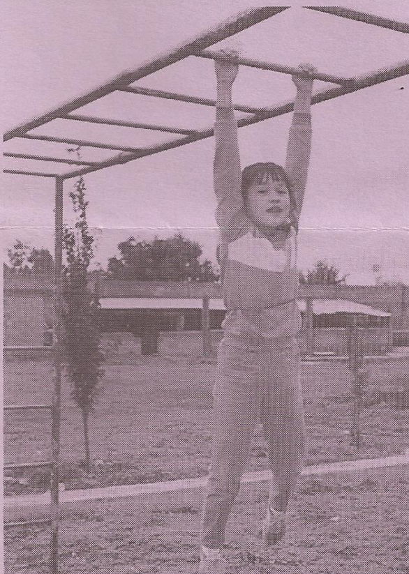
This play equipment will get us ready for the Olympics!