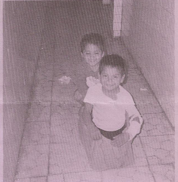
How do you like our car? It works pretty good on our slippery floor.